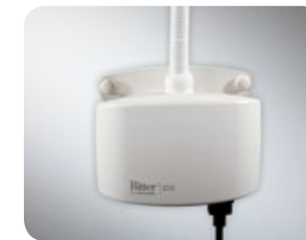
Wall mount bracket