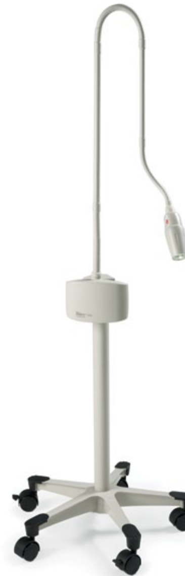
Mobile Ritter 253 LED Exam Light with caster base