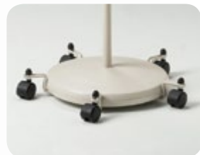
Add mobility to the 250 exam light with the optional base accessory.

The Ritter 250 LED Exam Light takes our proven exam room lighting and makes it even better by incorporating LED technology for longer life and reduced energy consumption.