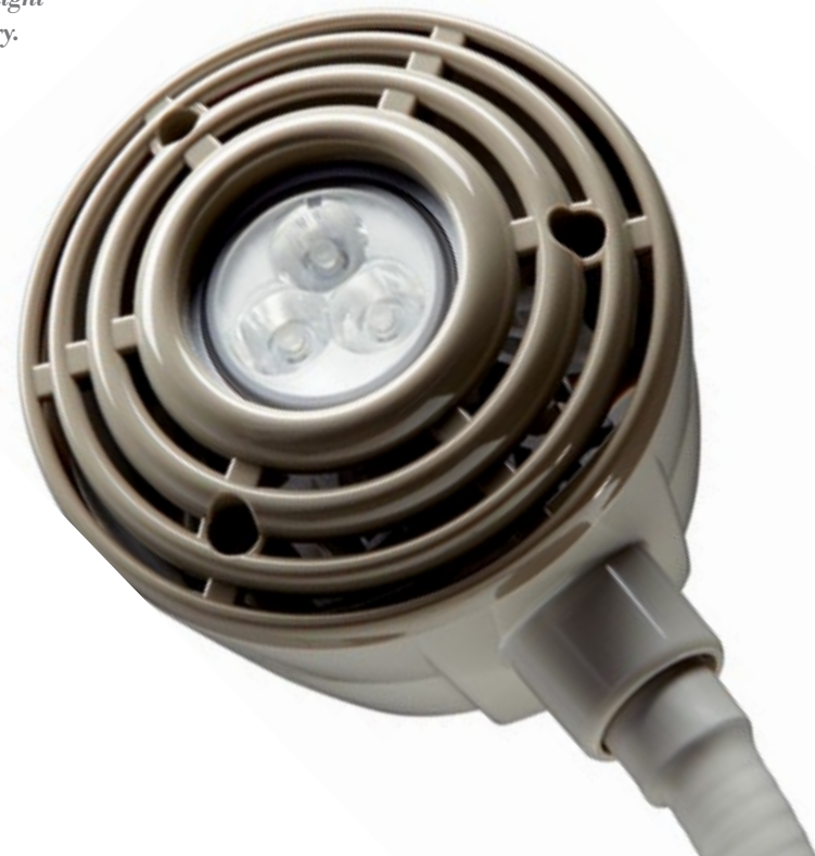
Ritter 250 LED Exam Light